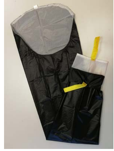
Figure 2. Finalized Handy Pants.