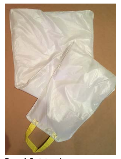
Figure 1. Prototype 1.

Between April 2012 and December 2013, 220 interactive training sessions were given to around 2400 home care workers at Fokus Wonen with the aim of finding solutions