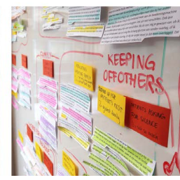
Figure 1: Field research study: Steps taken to get to know the ICU nurses and the ICU sound culture via observing, sensitising and interviewing nurses who were the centre of attention.

Though different sound cultures and coping strategies with the sounds exist, I found a commonality regarding the excessive amount of sounds in an ICU: in all ICUs, the sounds (or even issues with them) are accepted to a greater or lesser extent due to nurses not knowing why (by being ignorant or indifferent) or not knowing