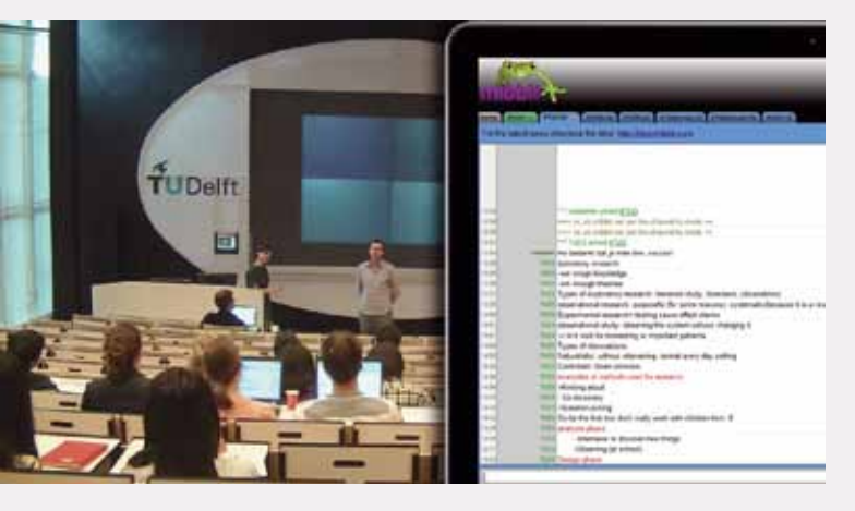
Figure 2. Multiple students in condition B (linear & crowdsourcing)