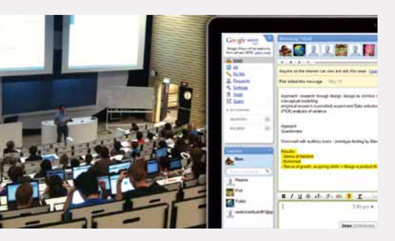
Figure 3. Multiple students in condition D (dynamic & crowdsourcing)