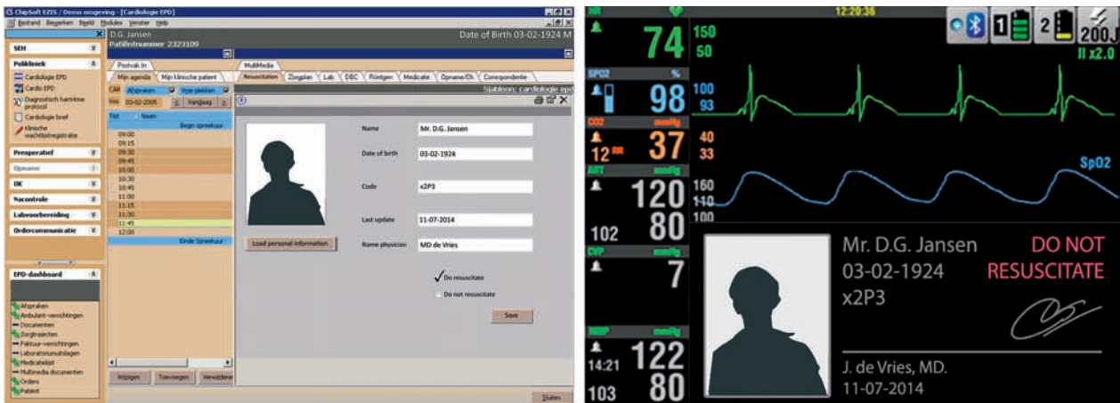
Figure 3. Left: example of a simulation screen of the physician's system, shown during the updating procedure. Right: example of a simulation screen of the ambulance personnel's system, shown during the resuscitation situation (*fictional data).

Besides the Heartbeat prototype, a PowerPoint simulation slideshow (see figure 3, left) on a laptop was used to simulate the updating and reading procedure at the general practitioner's office. The PowerPoint simulation visualized the different steps the physician should follow and provided the possibility to see how the physician would interact with the Heartbeat system. Furthermore, the simulation gave the elderly the possibility to experience the complexity and the understandability of the Heartbeat system. To evaluate the Heartbeat system with ambulance personnel, another PowerPoint simulation was used during a simulated resuscitation situation (see figure 3, right). This simulation visualized the DNR messages including the sound provided by the monitor.