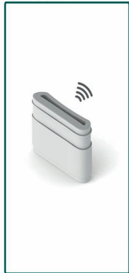
Figure 2. Storyboard showing the intended use of the Heartbead system