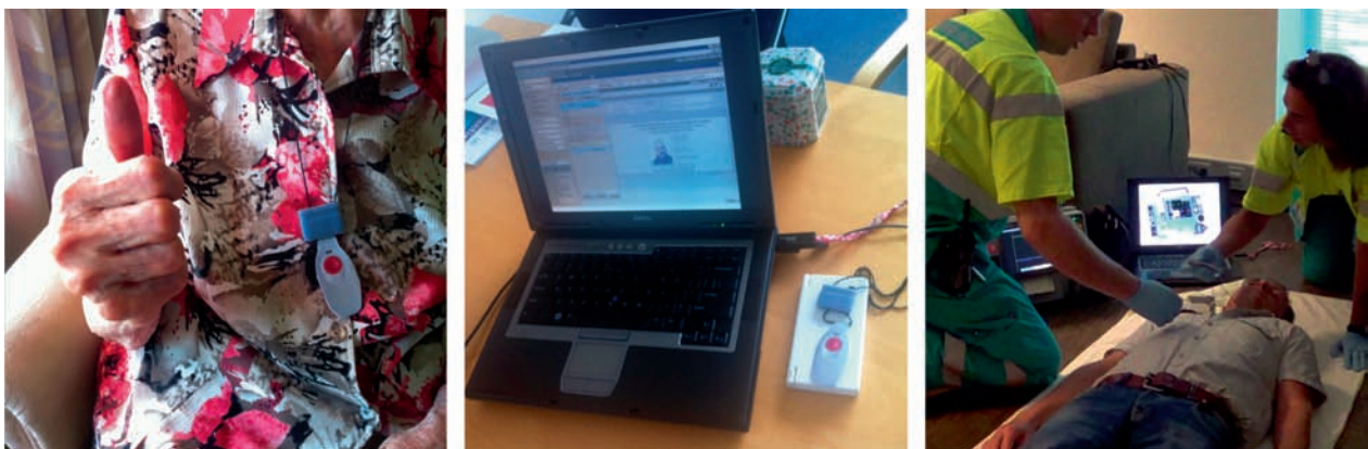
Figure 4. Left: evaluation with a frail older person. Middle: evaluation with a physician. Right: resuscitation simulation with ambulance personnel.

Four physicians were interviewed (see figure 4, middle) about the Heartbeat system: one general practitioner specialized in elderly care, one specialist geriatric medicine working in a nurse home, and two clinical geriatrists. All four physicians found that the procedure fitted their workflow, and that it did not require a lot of effort to understand the Heartbeat system and to